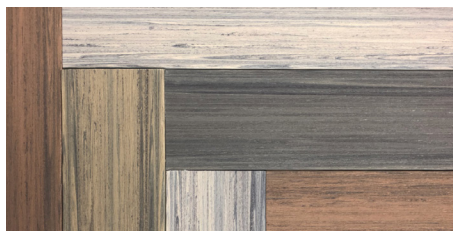
Deckorators Voyage™ composite decking in Costa, Mesa, Sierra and Tundra

"The whole process of building a deck is something homeowners typically do only once or twice in their lifetime, and it can be overwhelming. Once homeowners make the decision to add a deck to their home, we recommend that they connect with a certified deck contractor who can help plan and fulfill their personal vision for the space."