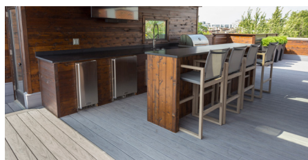
Rooftop deck with Deckorators Vault™ composite decking built by Unique Deck Builders, Highland Park, Illinois