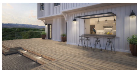
Deckorators Voyage™ Costa composite decking, Deckorators SLX Cable rail, and Deckorators by Hinkley Luna step lights

"A deck is more than just a place to make memories and enjoy some peace of mind. Well-done decks are consistently reported as a home project with a high ROI when it comes to resale value. In fact, we're seeing some real estate agents listing square footage of outdoor space because it's becoming a feature home buyers are looking for."