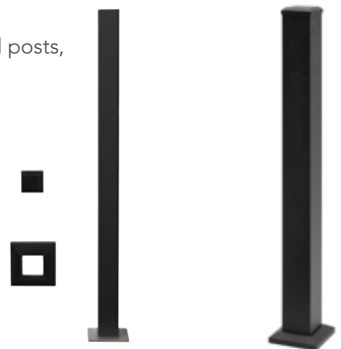
2½" Aluminum Post