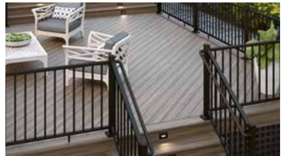
4" Aluminum Post