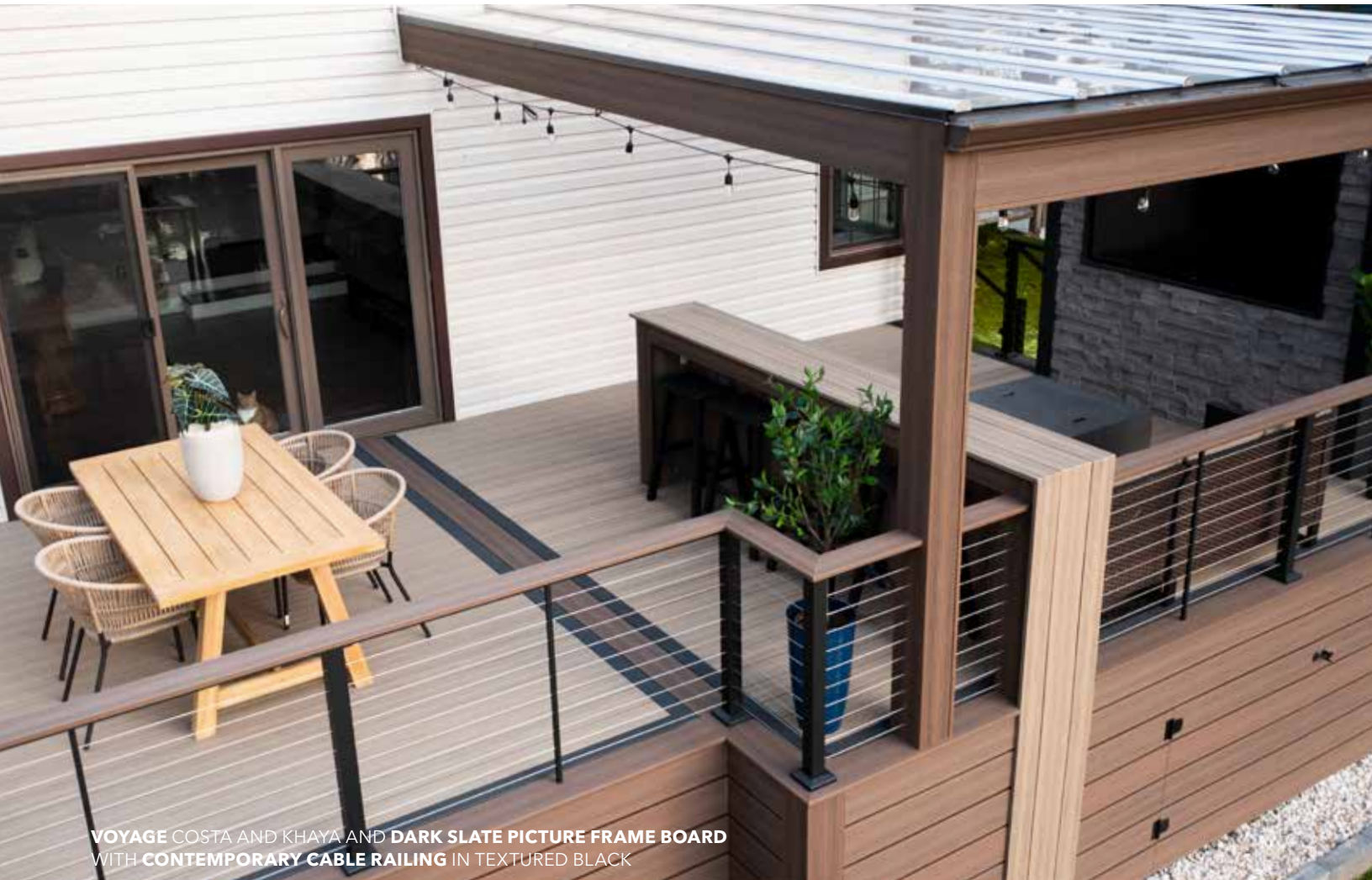
VOYAGE COSTA AND KHAYA AND DARK SLATE PICTURE FRAME BOARD WITH CONTEMPORARY CABLE RAILING IN TEXTURED BLACK

Voyage decking featuring Surestone® technology combines durability and style for outdoor spaces that perform in every condition. With enhanced traction and heat-resistance, Voyage delivers real-wood looks and enduring performance that stands up to whatever your outdoor life demands.