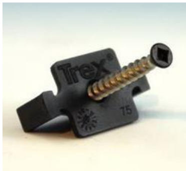
Figure 2: Trex