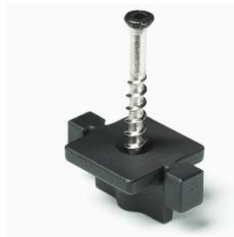
Figure 3: Stowaway