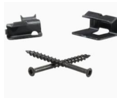
Figure 4: VersaClip