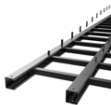
"Quick pin" technology